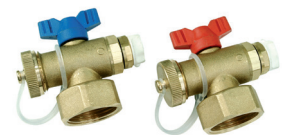
UFH-ESK060303-M Length + 60mm