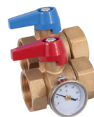
UFH-BTM0606-M Length + 60mm